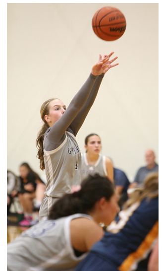
Varsity Gryphon Women take a win, 42-33, against Timberlake Christian on Dec. 16.