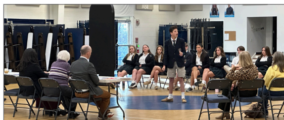
Judges evaluate a noted Shakespeare monologue.