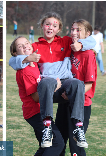
Scenes from the Middle School Fall Festival held just before the Thanksgiving Break.