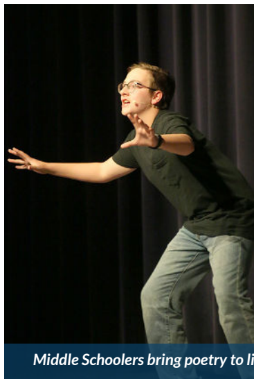
Middle Schoolers bring poetry to life at the Moomaw Center on Friday.