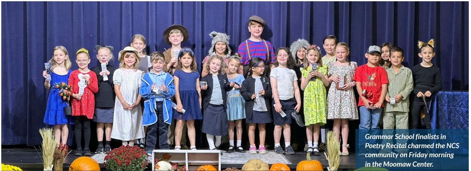
Grammar School finalists in Poetry Recital charmed the NCS community on Friday morning in the Moomaw Center.