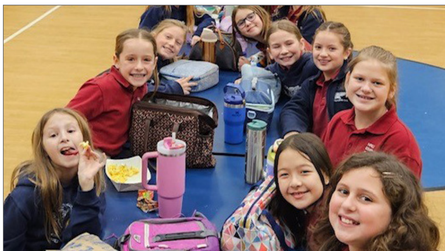
Lunchtime in the Moomaw Center is always good nutrition, along with friends and smiles.

The NCS Café is rolling out a new quarterly lunch and milk ordering plan for the 2025-26 school year. Our purpose is to simplify the ordering process and offer some ways to save money, too. You order lunch each quarter—not each month. That means only 4 times a year! Order NOW through August 4 for the first quarter. Details inside!