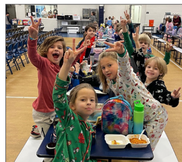
Special school days like PJ Day are celebrated over chicken nuggets and mac 'n' cheese.