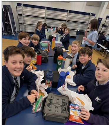
Students love Jersey Mike Thursdays!

BUYING PIZZA AT THE LUNCH WINDOW (no preordering) —Slices of cheese or pepperoni pizza may be purchased at the lunch window WITHOUT preordering.