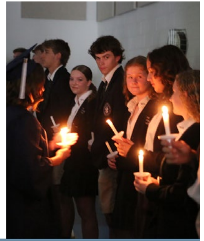
The Passing of the Torch Ceremony brought together Seniors, Juniors, and the Kindergarten classes last week.