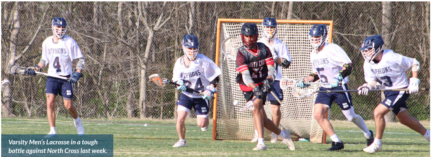
Varsity Men's Lacrosse in a tough battle against North Cross last week.