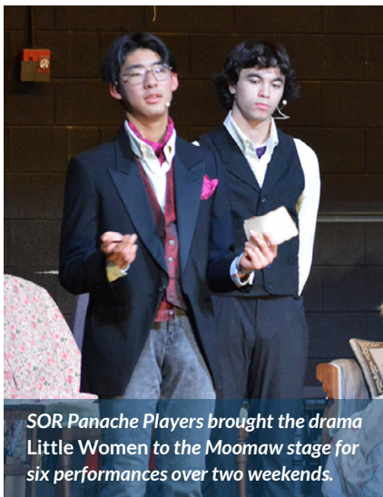
SOR Panache Players brought the drama Little Women to the Moomaw stage for six performances over two weekends.