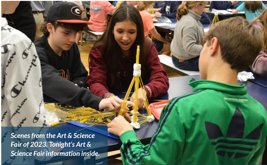
Scenes from the Art & Science Fair of 2023. Tonight's Art & Science Fair information inside.