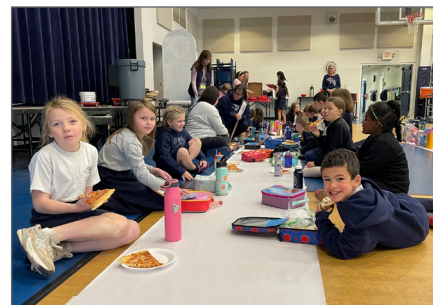
First graders reclining for lunch on Latin Day last Friday.

The Middle School council is hosting a "Soup-er Bowl" food drive for the Blue Ridge Food Bank. There are four team labeled containers placed in the four middle school classrooms. Each container is labeled with one of the four team colors. Students should place their donations of non-perishable food items in their team's containers. Whichever team donates the most food will win 2 points for their team. This event is only for Middle School students. We will be collecting food now through this Wednesday, February 14 .