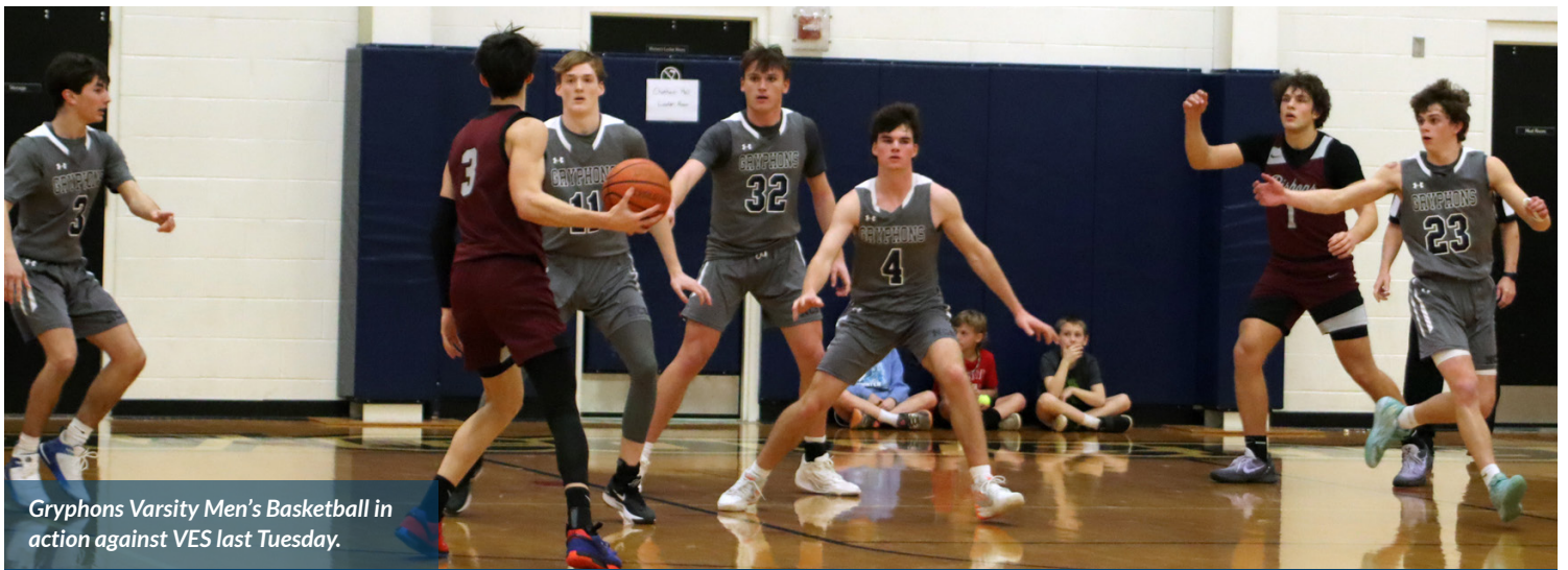
Gryphons Varsity Men's Basketball in action against VES last Tuesday.