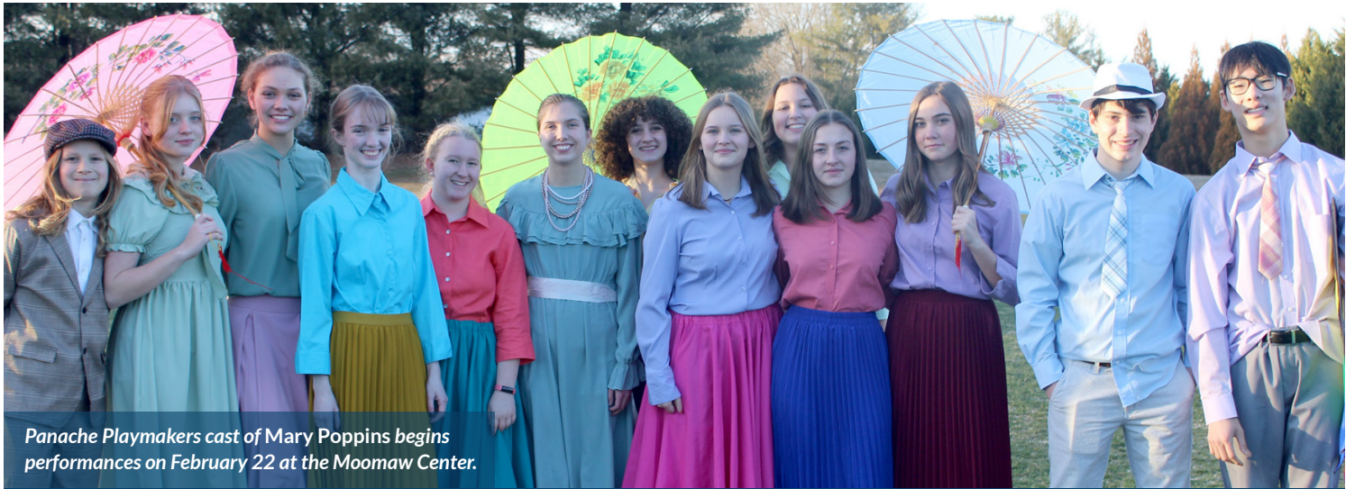
Panache Playmakers cast of Mary Poppins begins performances on February 22 at the Moomaw Center.