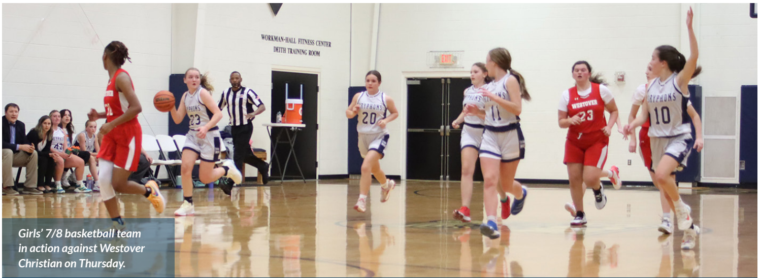
Girls' 7/8 basketball team in action against Westover Christian on Thursday.