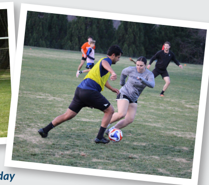
NCS alumni gathered for the annual Alumni Soccer Game on the Friday after Thanksgiving to renew old friendships and dust off old cleats.