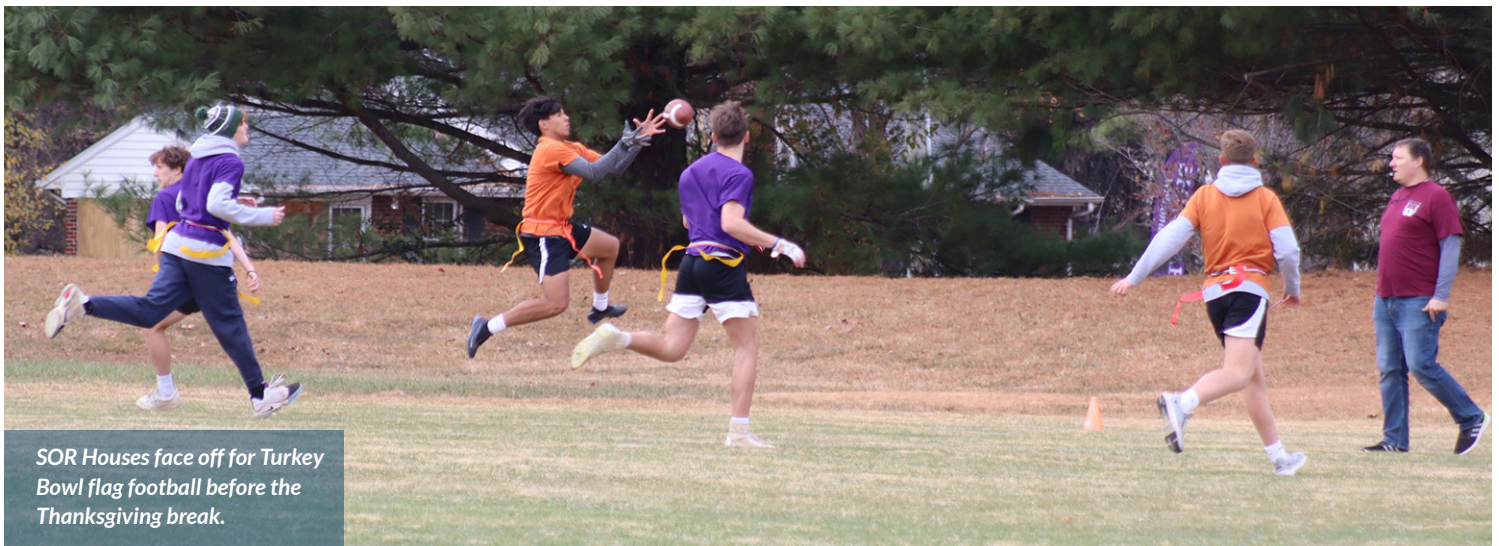
SOR Houses face off for Turkey Bowl flag football before the Thanksgiving break.