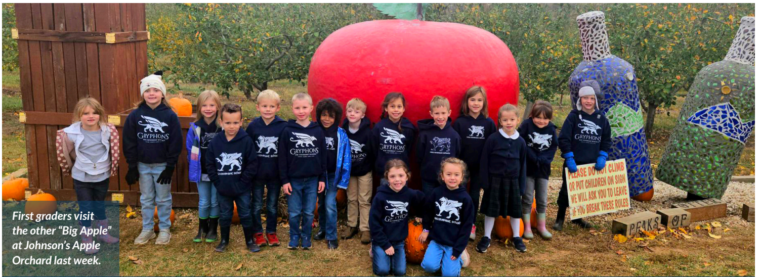
First graders visit the other “Big Apple” at Johnson’s Apple Orchard last week.