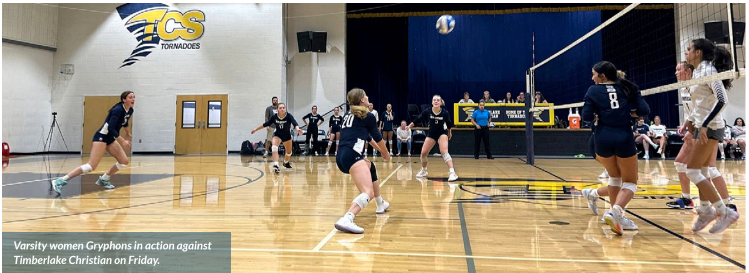
Varsity women Gryphons in action against Timberlake Christian on Friday.