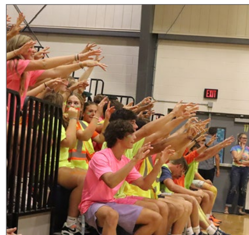
Students supporting Lady Gryphons on Friday with a Neon Night cheering section.

New Covenant will be proctoring the SAT for all interested seniors on Thursday, October 26 during the school day. Seniors do not need to register online to take this test. Information regarding payment and other details will be sent at a later date.