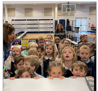
Kindergarteners sing to the lunch staff to show their appreciation.