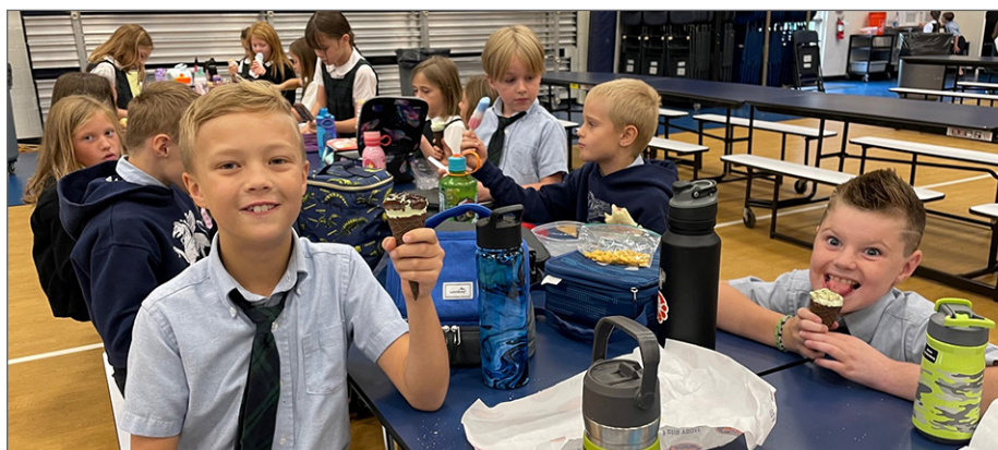
Lunchtime in the Moomaw Center is nutritious and balanced—even on ice cream Thursday.

When lunch ordering opens, log in to your FACTS (RenWeb) account to place your order. The district code is NCS-VA. Ordering typically runs the first two weeks of each month and covers the following month. At the beginning of school, however, the first ordering period covers August and September.