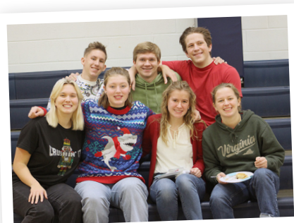
REMEMBERING The Christmas party, December 2022.

Thesis Title: "Jack's Conundrum: How the Mind of the Renaissance Man Saves Society From Bigotry and Specialization"