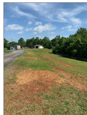
Renovation plans for the back campus recreation expansion and beautification.