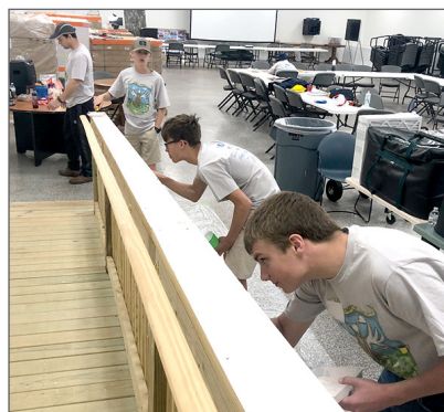
(Left) Students working to beautify The Arc with new landscaping. (Top) Sixth graders pitching in at the Miller Home for Girls. (Bottom) Eighth graders painting at Monacan Indian Nation.