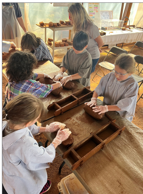
First graders make bricks by hand at recent field trip to Thomas Jefferson's Poplar Forest.