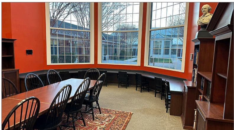
Phases of construction and the finished new listening center in the library.