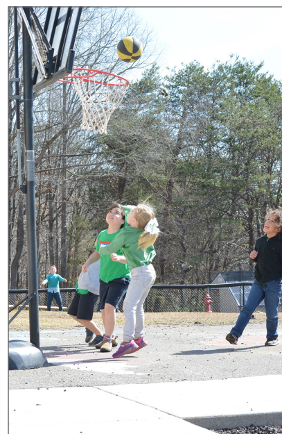
Even first-graders get into the spirit of March Madness at recess.

the school's literary arts magazine! The deadline is Tuesday, April 11 . Ten house points will be awarded for each submission, maximum 30 points per person. Word limit for written works is 1,000 words, and please note that all art will be printed in black and white.