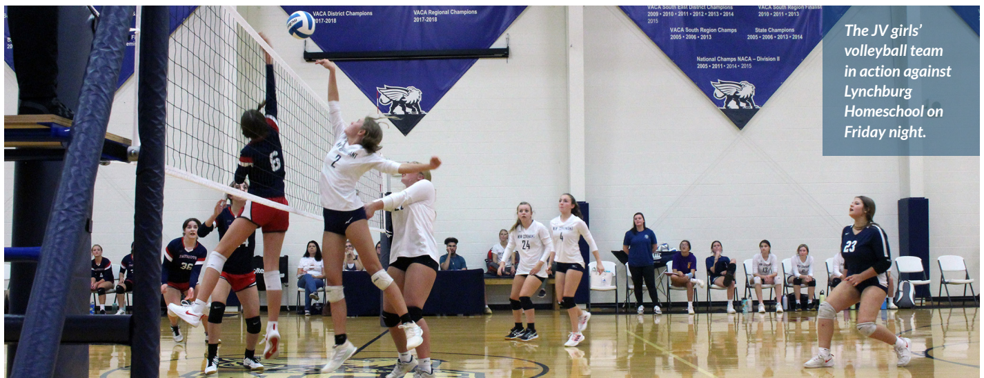
The JV girls' volleyball team in action against Lynchburg Homeschool on Friday night.