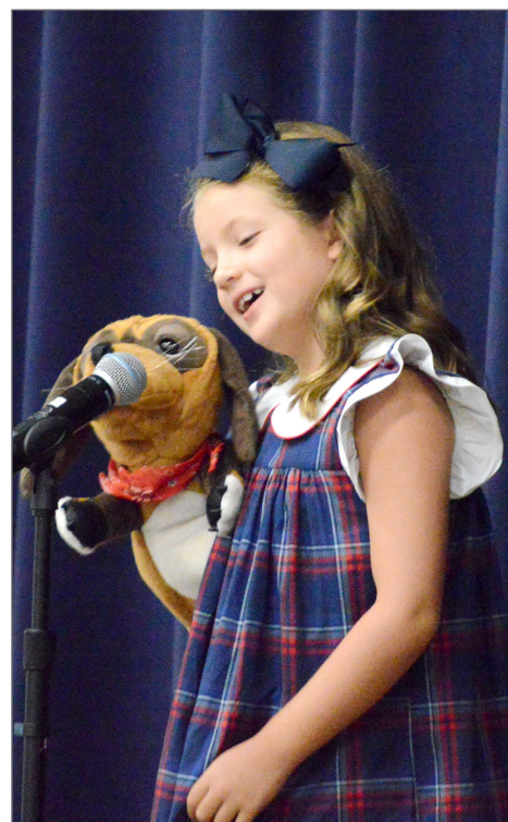
Grammar School poetry recitals bring out creativity of every sort.

Grammar School classes will begin holding poetry recitals next week with the Grammar School Poetry finals to be held on Friday, September 23 at 8:00am. Please refer to your FACTS account for individual classroom details.