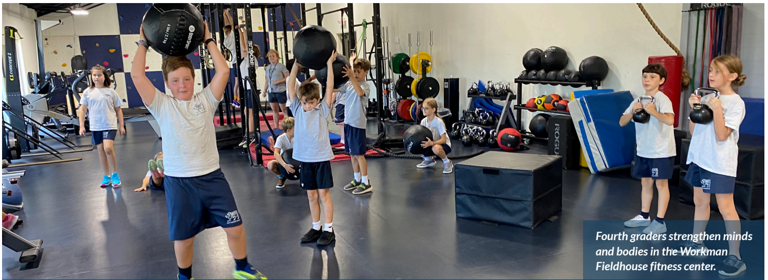
Fourth graders strengthen minds and bodies in the Workman Fieldhouse fitness center.