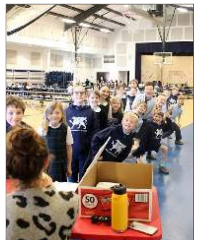
Thursday ice cream is a crowd pleaser.