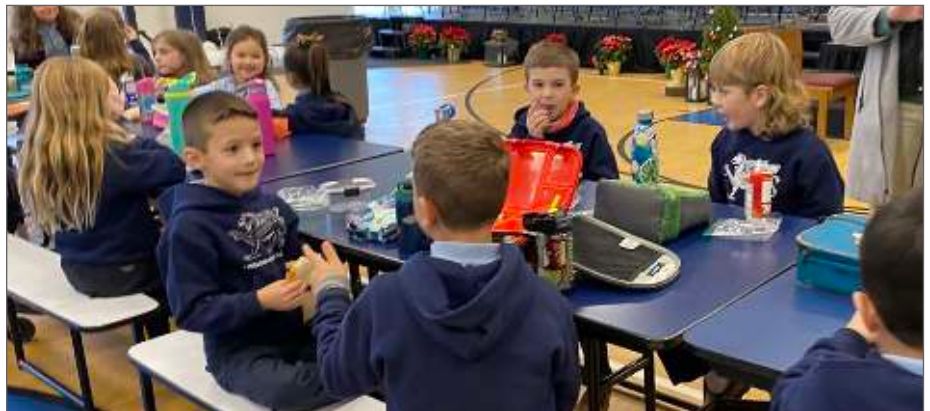
Students enjoy their daily lunchtime in the Moomaw Center.

When lunch ordering opens, log in to your FACTS (RenWeb) account to place your order. The district code is NCS-VA. Ordering typically runs the first two weeks of each month and covers the following month. At the beginning of school, however, the first ordering period covers August and September.