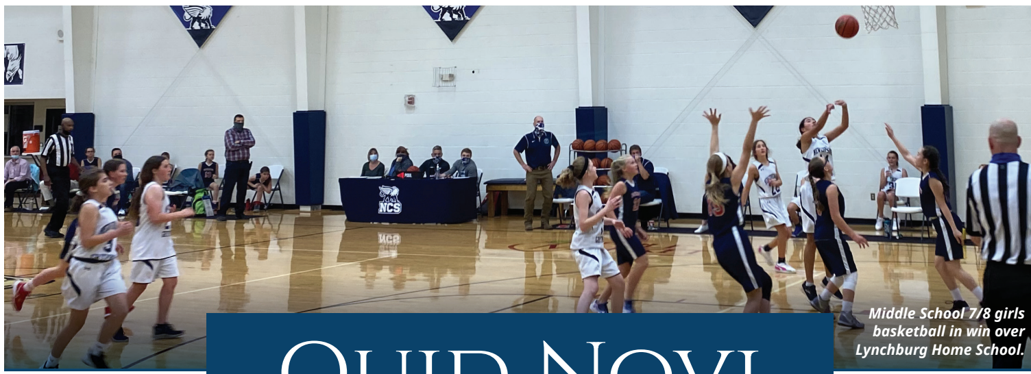
Middle School 7/8 girls basketball in win over Lynchburg Home School.