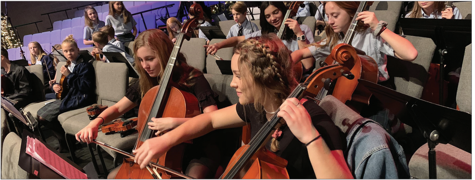
Students preparing for the 2019 Lessons and Carols performance.